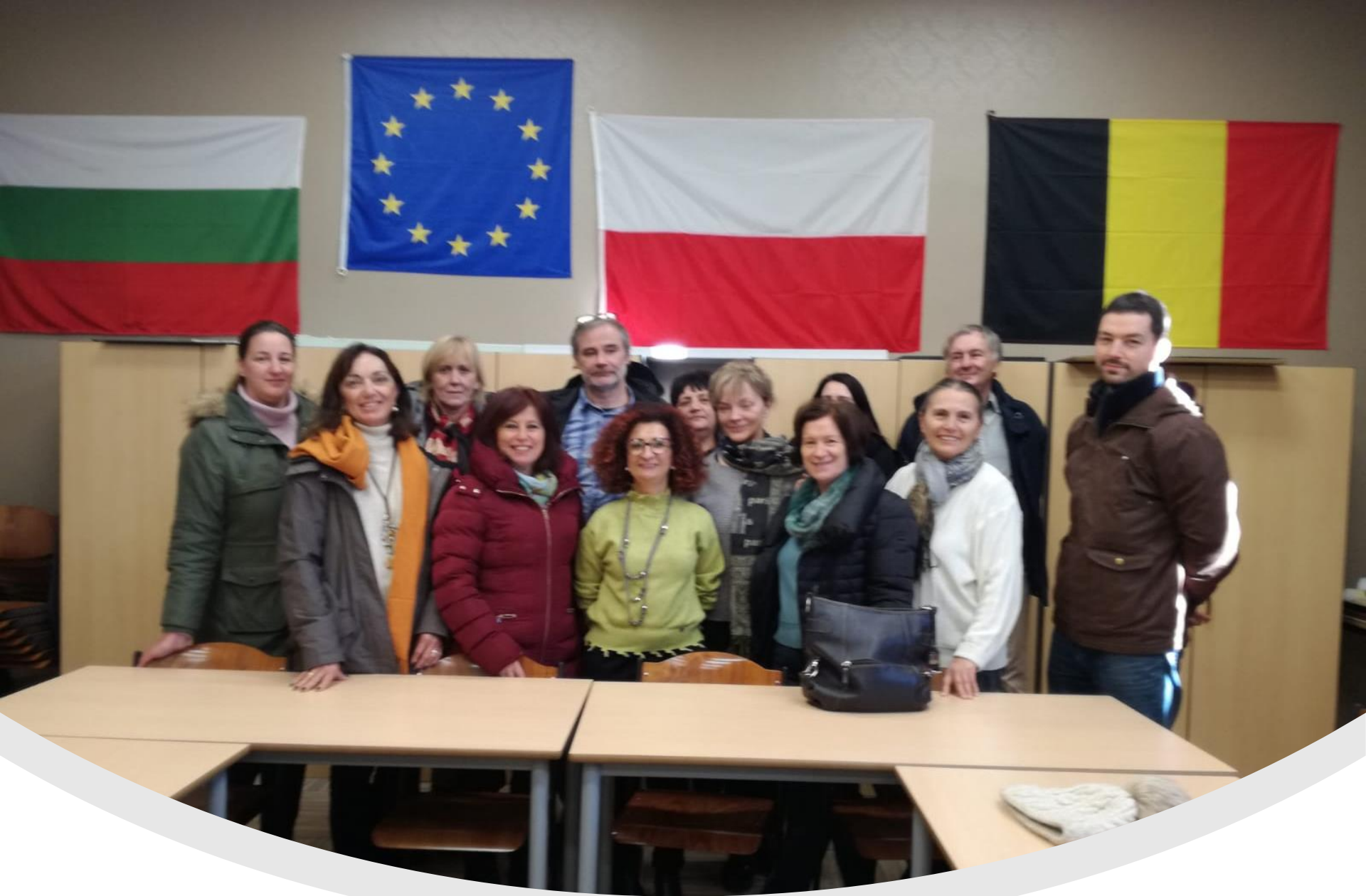
Erasmus team before the start of the training: "Open teaching strategy in shaping social and civic attitudes"